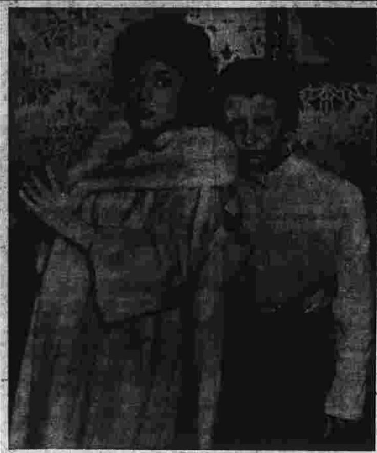
Granny (Irene Ryan) isn't too impressed with Elly May's (Donna Douglas) mink coat in "The Beverly Hillbillies," hit comedy series on CBS-TV Wednesdays at 9 p.m.

"I was a real tomboy, but it was a matter of survival," she recalls. "I was the only girl on either side of my family and I was surrounded by boys—an older